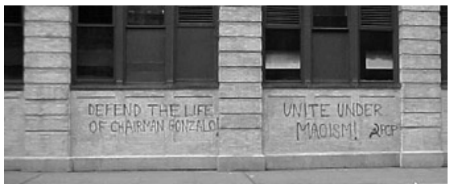
United States, 1 st of May 2005

“Defending Chairman Gonzalo means defending Maoism and its application in every part of the World”