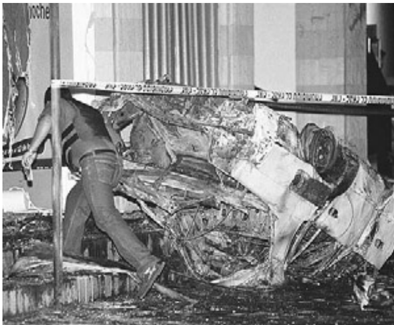
The action against the Yankee embassy and Bush’s visit in 2001

development of the People’s War today are more favorable than ever before; the People’s War is thus accelerating the enemy’s decomposition and this facilitates the sweeping away, piece by piece, of the old state. The enemy is not in