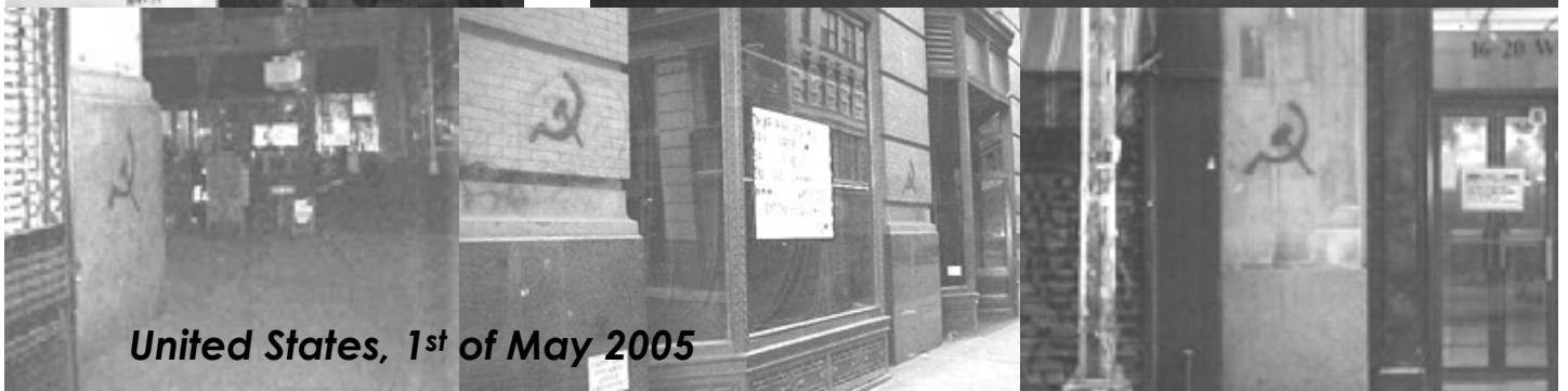
United States, 1 st of May 2005