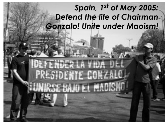
Spain, 1 st of May 2005: Defend the life of Chairman Gonzalo! Unite under Maoism!

“Chairman Gonzalo is the one who has defined Maoism as the third, new and higher stage of Marxism, creatively applying it to the Peruvian revolution, initiating and developing the People’s War in Peru, embodying Gonzalo Thought, the all-powerful ideology that guides our Party and our revolution. He is the Great Leader of the Party and the revolution, the center of Party unity and our guarantee of triumph until Communism - the greatest living Marxist-Leninist-Maoist on the face of the Earth and a teacher of communists”.