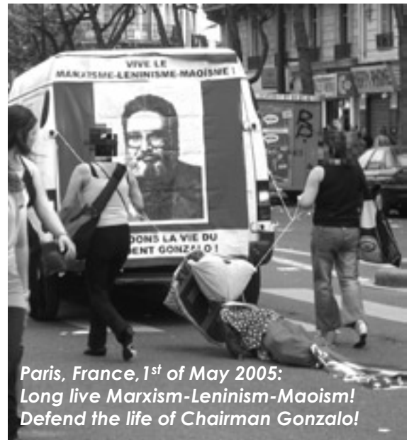
Paris, France, 1 st of May 2005: Long live Marxism-Leninism-Maoism! Defend the life of Chairman Gonzalo!

“Chairman Gonzalo is the one who has defined Maoism as the third, new and higher stage of Marxism, creatively applying it to the Peruvian revolution, initiating and developing the People’s War in Peru, embodying Gonzalo Thought, the all-powerful ideology that guides our Party and our revolution. He is the Great Leader of the Party and the revolution, the center of Party unity and our guarantee of triumph until Communism - the greatest living Marxist-Leninist-Maoist on the face of the Earth and a teacher of communists”.