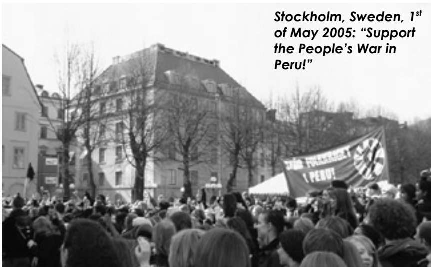
Stockholm, Sweden, 1 st of May 2005: "Support the People's War in Peru!"

"On this day, filled with revolutionary optimism and joy, we see how the universal truths of Marxism-Leninism-Maoism , and the great contributions to its development made by our Great Leader Chairman Gonzalo, shaped through the creative application of Maoism to the concrete conditions of the Peruvian revolution - Gonzalo Thought - are confirmed more every day; we are experiencing the New Great Wave of the World Proletarian Revolution, and revolution is the principal historical and political tendency in the world today".