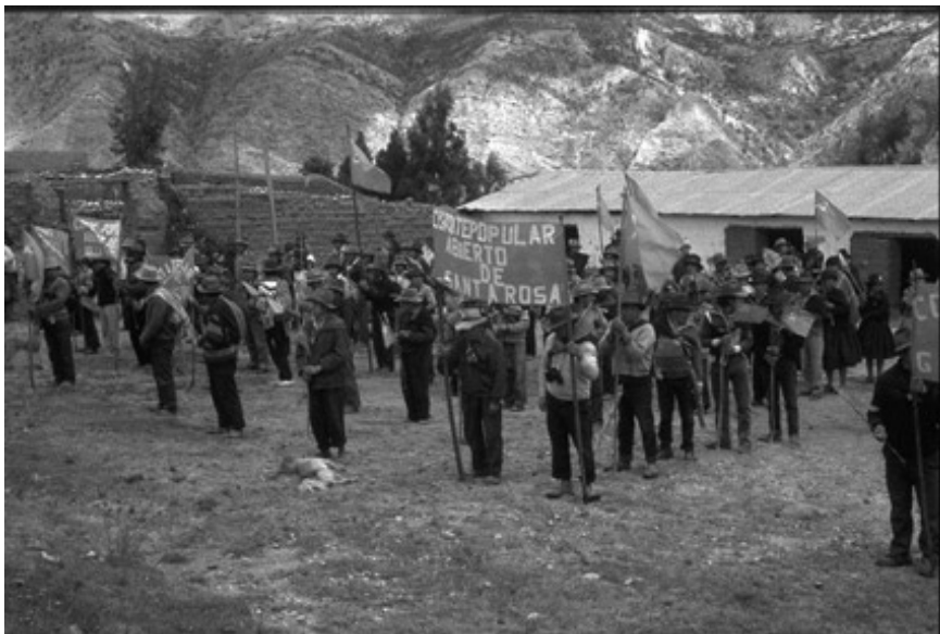
An Open People's Committee

process of re-establishment and counter-re-establishment, the People's Committees are not only being maintained but develop, defended by the PLA, that defeats all the enemy's campaigns of encirclement and annihilation, from where the enemy's forces have run away like chickens and do not even dare to approach by air, proving how the anti-aircraft defense of the PLA has developed, proving