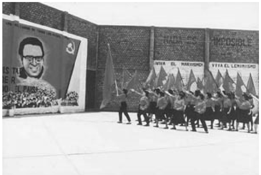
Female political prisoners and prisoners of war of the Communist Party of Peru

On the other hand, we reaffirm ourselves in the truth stated by Mariátegui, that “ In the current human panorama, class differentiates individuals more than sex ”. Thus, in order to emancipate themselves, women must forge themselves as proletarians above all – as the Great Lenin said: “ The woman continues to be a slave of the home, despite all the liberating laws, because she is overburdened, oppressed, stupefied, humiliated by the menial domestic tasks, which make her a cook and a nurse, which waste her activity in an absurdly unproductive, menial, irritating, stupefying and tedious labor. The phrase emancipation of women will only begin for real in the country at the time the mass struggle begins (led by the proletariat already owning the power of the State) against this petty home economy, or more precisely, when their mass transformation begins in a large-scale socialist economy. ” ( A Great Initiative; emphasis in original. ) This means, that women must crush and sweep away the idea that someone else is responsible for their liberation. The women of the proletariat and the people themselves must struggle, alongside their class brothers, against the reactionary positions on this issue, among men and women, and take the decision to no longer be “the weaker sex”, but to become instead heroines of the proletariat, fighting alongside the men in people’s war until Communism – and not until then will the oppression of women completely be swept away.