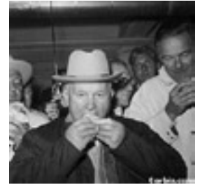
Khrushchev, revisionist dog

in a Discussion with Comrades on Epistemology: On Knowing and Changing the World" Revolutionary Worker #1262, December 19, 2004)