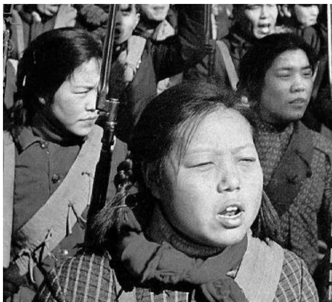
Women of the People's Liberation Army in China

in Iraq and Afghanistan when they talk about “emancipating the women from the oppression of Islam”. This black hoax has been unmasked and crushed over and over, and there appears to be an almost touching unity on this question among all those that claim to be revolutionaries. But what is behind this “unity”?