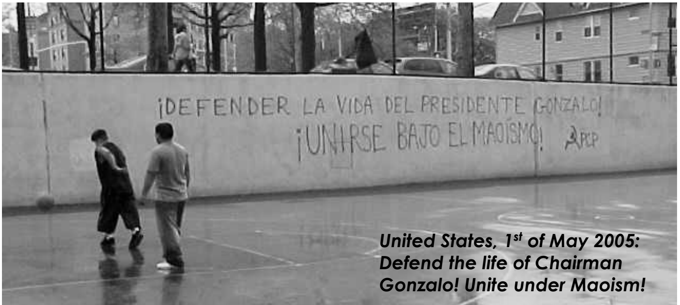
United States, 1 st of May 2005: Defend the life of Chairman Gonzalo! Unite under Maoism!

"On this day, filled with revolutionary optimism and joy, we see how the universal truths of Marxism-Leninism-Maoism , and the great contributions to its development made by our Great Leader Chairman Gonzalo, shaped through the creative application of Maoism to the concrete conditions of the Peruvian revolution - Gonzalo Thought - are confirmed more every day; we are experiencing the New Great Wave of the World Proletarian Revolution, and revolution is the principal historical and political tendency in the world today".