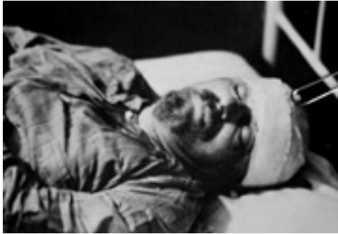
Trotsky, dead revisionist

in a Discussion with Comrades on Epistemology: On Knowing and Changing the World" Revolutionary Worker #1262, December 19, 2004)