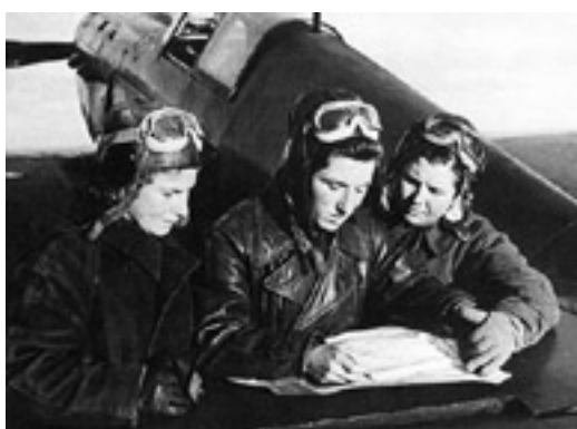
Women of the airforce of the Soviet Union

to take into account the argument that, after all, even if there are many outrages in terms of the oppression of women in a country like the U.S., it is still qualitatively better than what it is like under the Taliban.” , and although he does think that “This is a difficult and “tricky” contradiction to deal with” , one must admit that he is here pretending to “tell the truth”, with tears in his eyes, and confesses that he believes that the bourgeois democratic revolution of