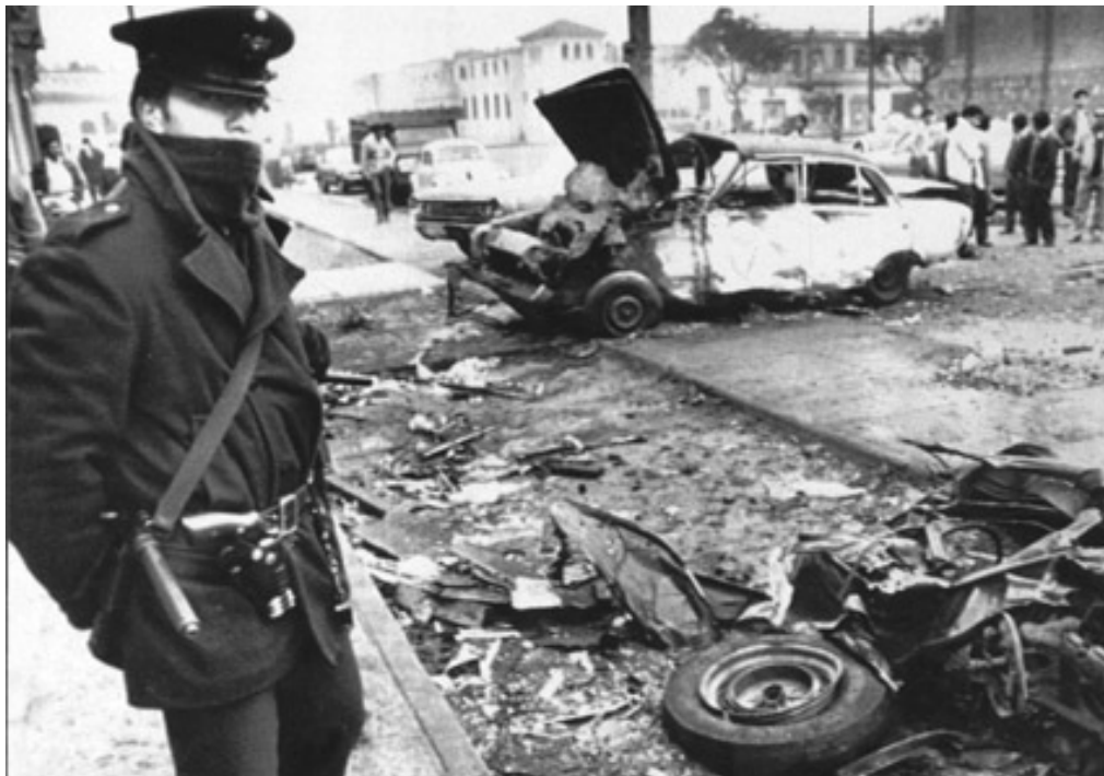
Car-bomb of the Party in 1985

of this is with perfect clarity expressing the worsening of the condition of being semifeudal and semicolonial, subjected to imperialism, principally Yankee imperialism, where a bureaucrat capitalism develops. All the promises made by this fascist, genocidal and country-selling