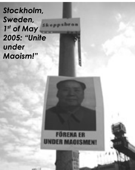
Stockholm, Sweden, 1 st of May 2005: “Unite under Maoism!”

“Defending Chairman Gonzalo means defending Maoism and its application in every part of the World”